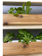
The Growing Wall

A cooperative project between Culinary Arts and Lab Tech students.